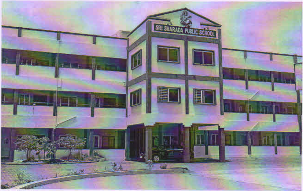
Fig 1: Front elevation