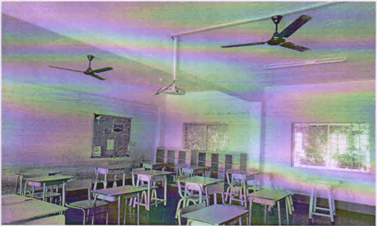
Fig 5: Intermediate Beams with Column