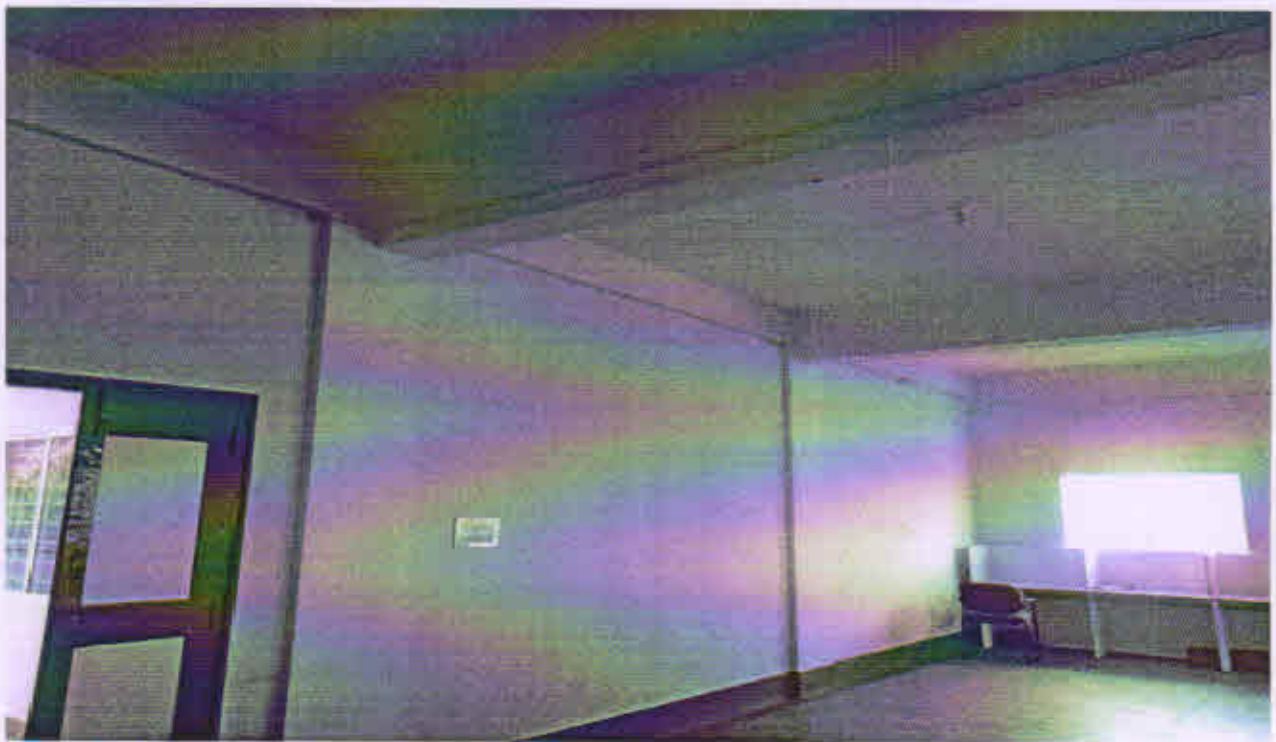
Fig 6: R.C.C Frame with column