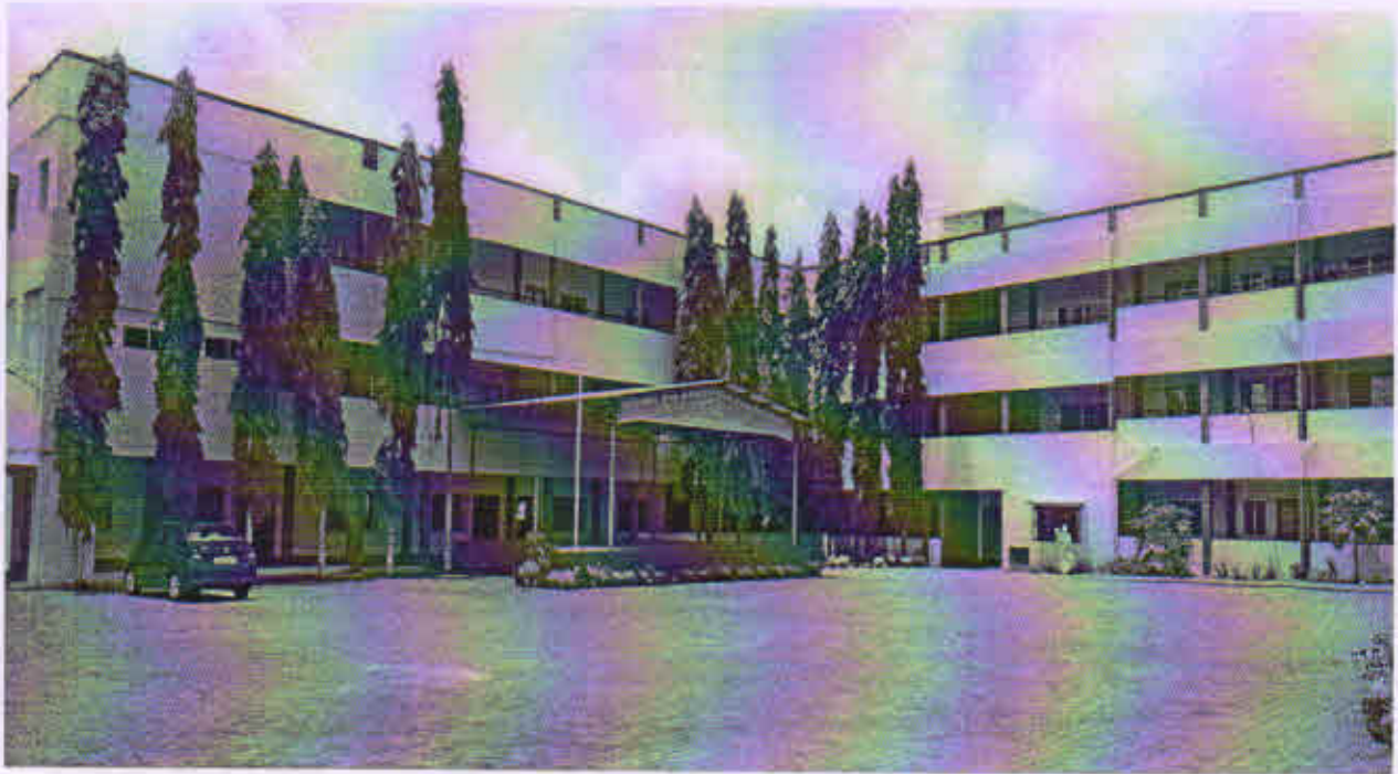
Fig 2: Side view