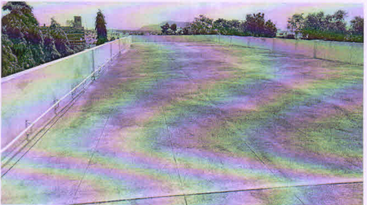
Fig 4: R.C.C Roof